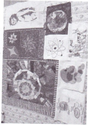
Fig. 2. Big History quilt

This is a photograph of the ‘Big History quilt’ (Fig. 2) and an excerpt from the accompanying blog (Fig. 3). It is appropriate and necessary to discuss student learning, approaches to curriculum frameworks, and pedagogies from theoretical and large-scale perspectives. However, the most meaningful enactment of all this discussion and decision-making plays out in the experience of an individual student. This is one such example.