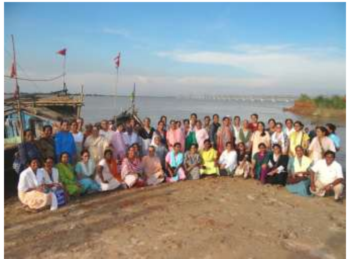
As part of the Eco-retreat the sisters spent an evening by the banks of the River Ganga

It was a beautiful moment to rest and to experience in the Cathedral of God . It has made us more nature friendly to see God in everything and to love every one.